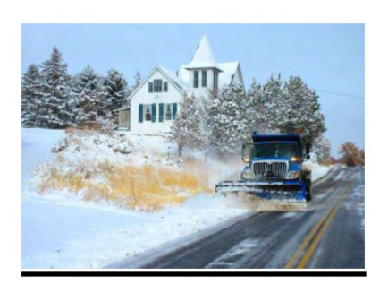
Food, Water and Shelter - Green