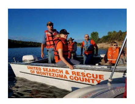
Safety and Security - Green

• No fire restrictions in Montezuma County