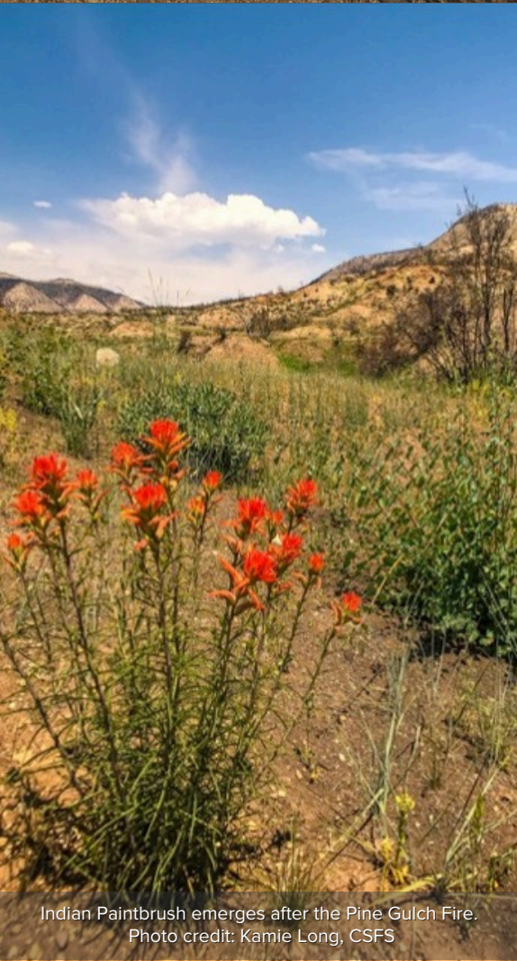
Indian Paintbrush emerges after the Pine Gulch Fire.