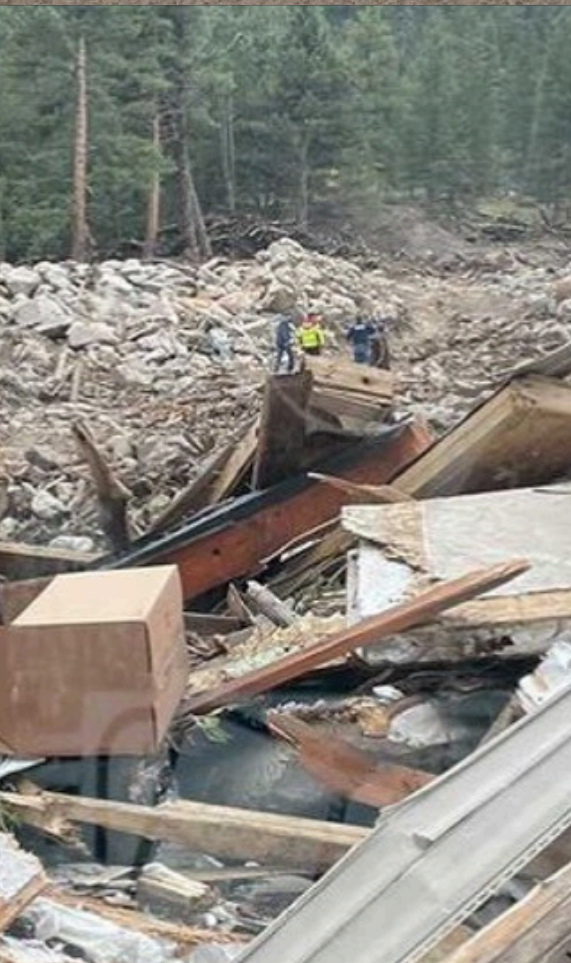
Post-fire flooding causes debris flow in the Cameron Peak Fire burn scar.