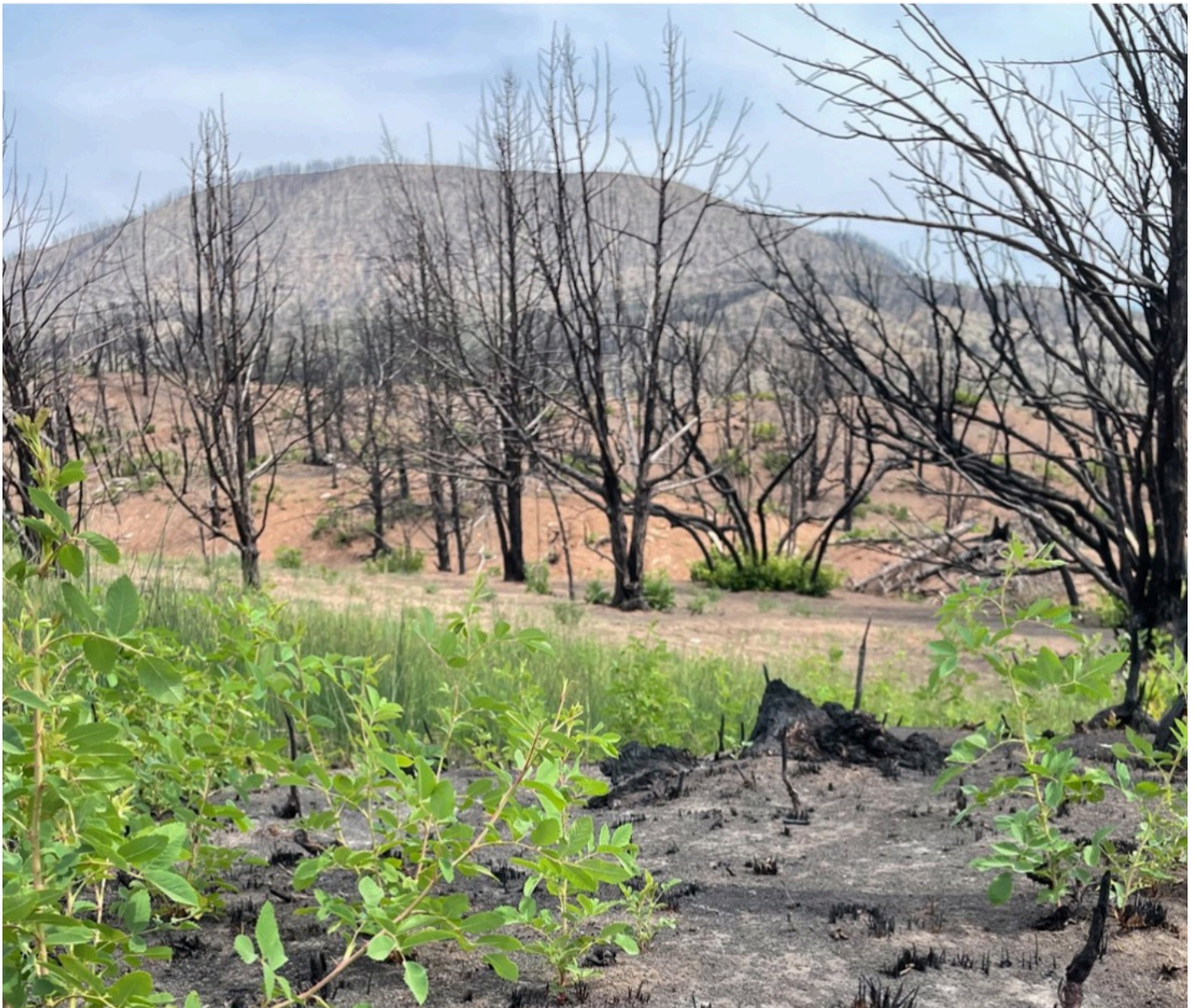
Woods' Rose and Gamble Oak regrows in the Pine Gulch Fire burn scar.