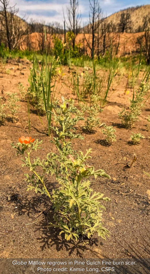
Globe Mallow regrows in Pine Gulch Fire burn scar.