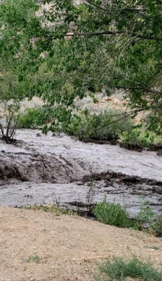
Post-fire flooding in the Pine Gulch Fire burn scar.