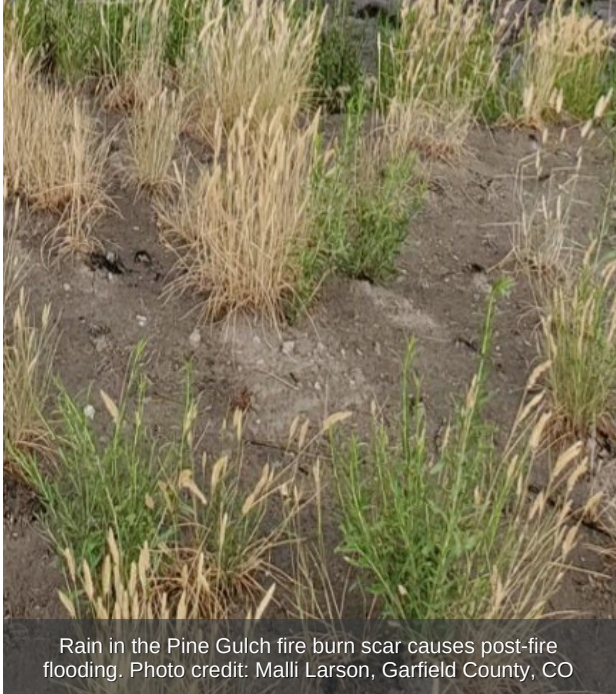
Rain in the Pine Gulch fire burn scar causes post-fire flooding.