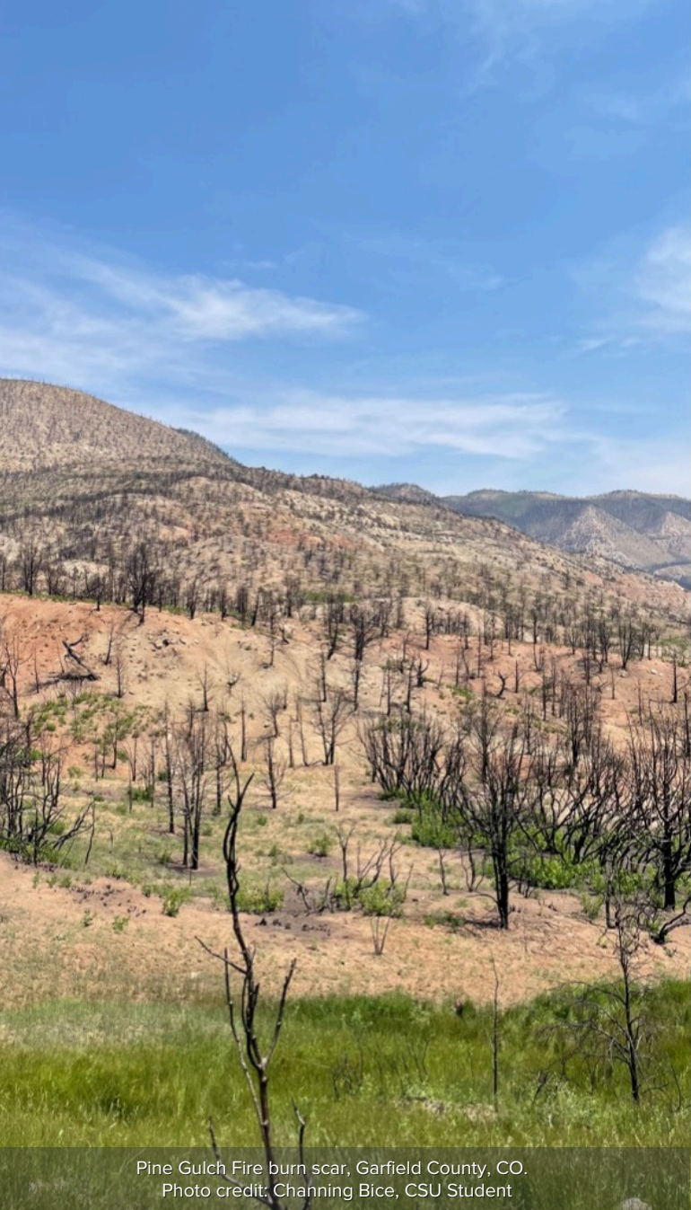
Pine Gulch Fire burn scar, Garfield County, CO.