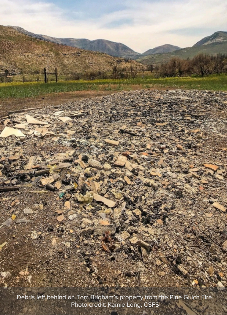
Debris left behind on Tom Brigham's property from the Pine Gulch Fire.