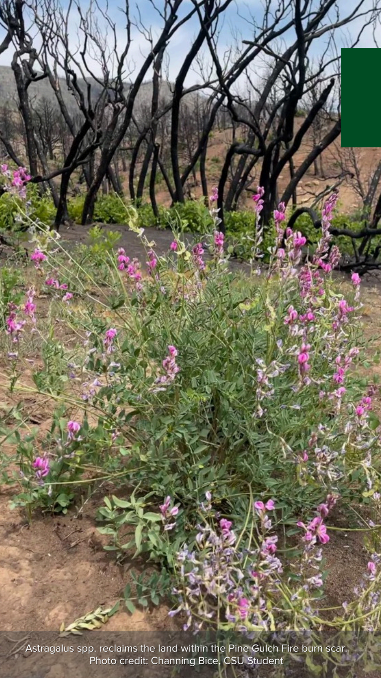
Astragalus spp. reclaims the land within the Pine Gulch Fire burn scar.